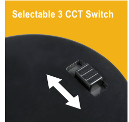
Selectable 3 CCT Switch