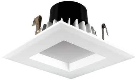
120V Triac Dimming Ver.

Use the switch to set the desired CCT (Correlated Color Temperature).