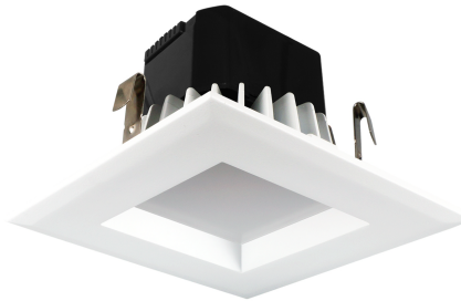
120-277V 0-10V Dimming Ver.